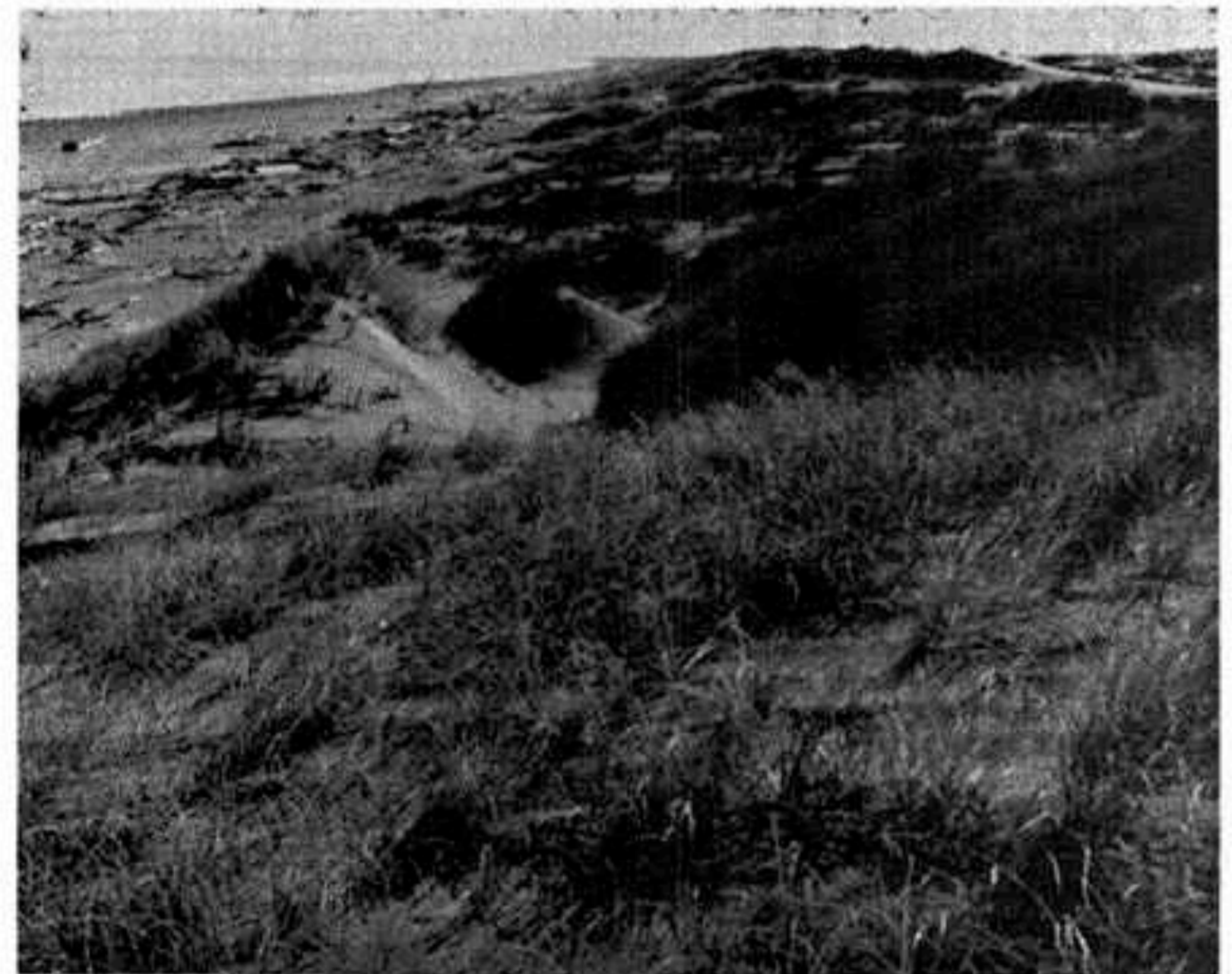
FIGURE 3. Fore dune showing Spinifex in the foreground and distance, marram on the steep face, and Desmoschoenus on the low gently-sloping face.

This has a fairly even height of 10 to 26 ft. above the strand line, a regular seaward face and a long irregular lee slope towards the plains. The profile is characteristic of sand-hills partly stabilised by vegetation but variations are imposed by the occupying species (Fig. 3). Along the Manawatu coast Spinifex is the dominant species on the seaward face of the fore dune. In this situation it is superior to marram as a dune builder and stabiliser because it has a greater tolerance of sea-water, provides an even cover, spreads freely down-slope in all directions and rapidly invades fresh sand deposits. The seaward face of a Spinifex fore dune slopes very evenly at 14–16 degrees up to a height of 20 ft. where it is frequently capped with marram. Blow-outs do not occur freely and those that do seem to originate where marram or Desmoschoenus grow with Spinifex . The tendency for Spinifex rhizomes to find concavities in the dunes and to gather sand helps to fill incipient channels and thus mould a more regular dune.