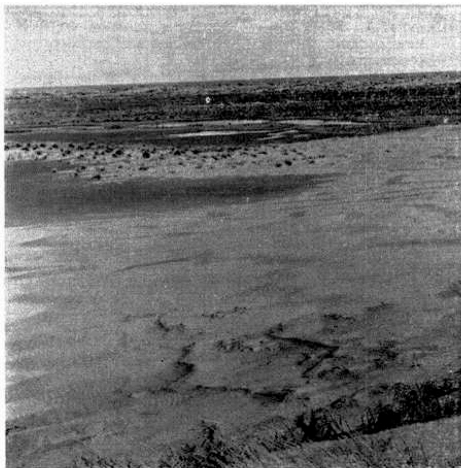
FIGURE 4. An array of sand plains with uncolonised plain at the toe of the wind sweep in the foreground. Flooded plains with sand plain pioneers and Leptocarpus near the fore dune in the distance.

Near the toe of the wind sweep, sand plains of the type described by Esler (1969) develop. Each is separated by a low sandy ridge from a similar plain of greater age on the seaward side (Fig. 4). In some places a series of these occurs but drifting sand usually obscures the earlier members of the sequence. This topography is created, in part, by the removal of sand by wind and, in part, by plants preventing deflation. As the wind sweep progresses inland it leaves at the toe a shallow, damp depression or sand plain, which quickly becomes colonised with sand pioneers, principally Myriophyllum votschii , Limosella lineata , Ranunculus acaulis and Selliera radicans . When Carex pumila appears it forms a girdle around the depression and collects sand to form a low dune up to half a chain wide. Here marram and Desmoschoenus establish freely, build the dune higher and replace Carex . At the same time a new depression forms at the toe of the receding wind sweep and another succession of plants is begun.